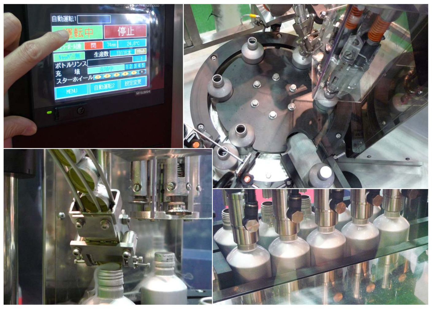
Zalkin capping head as standard setting for Bottle-Cans. (Other heads can be set by request)

Turret composition. After LN2 dosing, a cap is immediately put on the bottle mouth and sealed.